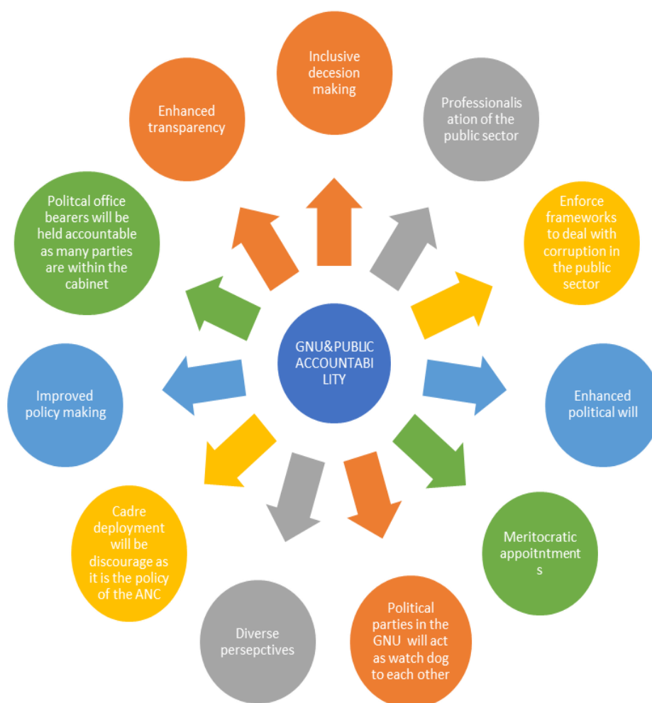
Figure.3. GNU can be off benefit to enhance public accountability

The government of national unity (GNU) might provide a rare chance to accelerate change and create a wealthier and more inclusive South Africa. 34 The GNU should concentrate on correcting fundamental structural inadequacies within the state, rebuilding public trust in the government, and increasing foreign community confidence in South Africa. This would lead to a more stable South Africa, allowing for economic progress. 35 The GNU may be beneficial to public accountability in the following ways: