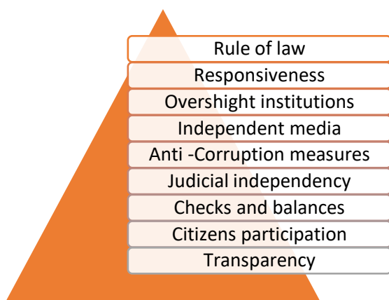
Figure 2. Features of Accountable Government Source: Own construction

Accountable government is an essential component of democracy . 15 To further strengthen the accountability of the government and the public service, parliament must improve its ability to hold political office bearers and public officials accountable.